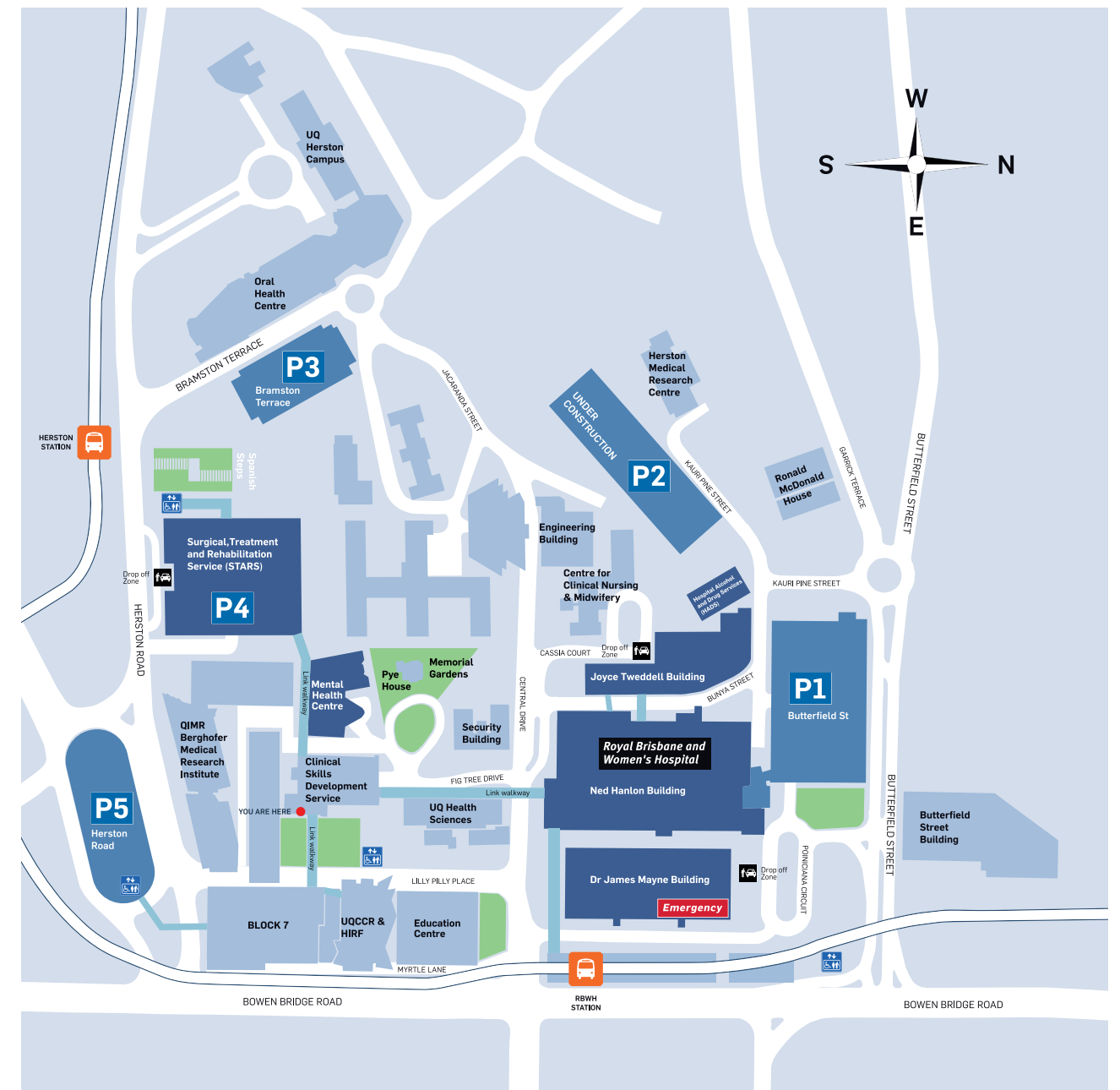
RBWH Campus Map

If you have financial hardship or special considerations and do not fit into one of the above categories, you may be able to apply for special needs. Please speak to the WeCU concierge staff about this.